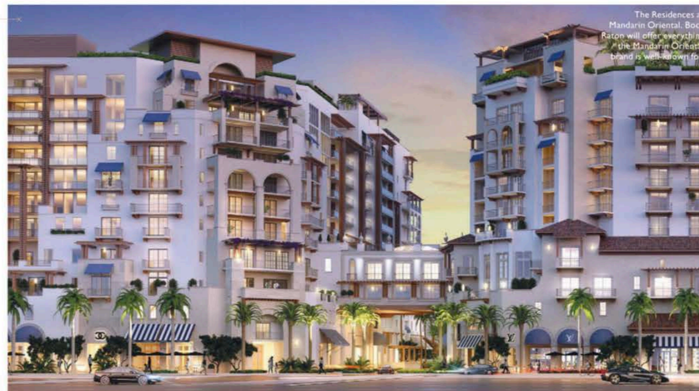
The Residences at Mandarin Oriental, Boca Raton will offer everything the Mandarin Oriental brand is well-known for.

Fans of the luxury hotel brand sharing the same name will truly appreciate what The Residences at Mandarin Oriental, Boca Raton will offer when it opens in 2021. Just one peek at its gleaming lobby trimmed with glittering gold finishes will suggest the beauty that awaits inside the property's 92 homes. Starting at 1,453 square feet, each offers remarkable views of the ocean, golf course and city, along with automated technology, outdoor kitchens, and Sub-Zero and Wolf appliances. The property's amenity package includes resident-only personal wine cellars, a game room, club room and private theater, and the hotel's spa and rooftop restaurant, which is accessible across a sky bridge. Membership privileges at Via Mizner Golf & City Club are also included. From $2 million, 10 E. Boca Raton Road, Boca Raton, 561.235.7773, moresidencesbocaraton.com