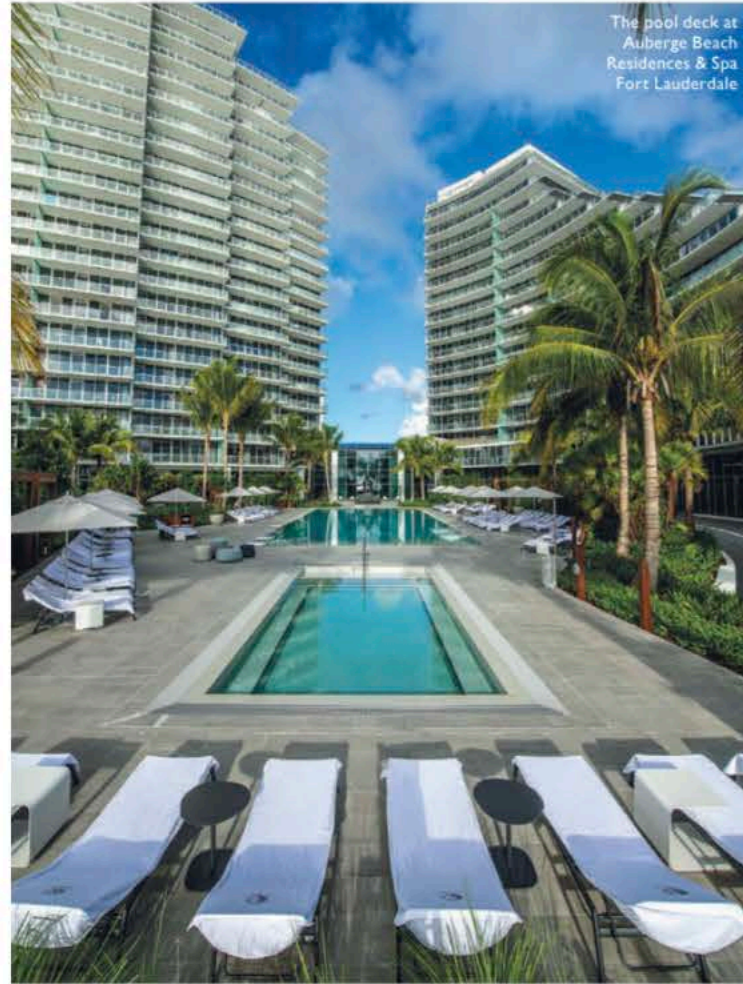
The pool deck at Auberge Beach Residences & Spa Fort Lauderdale

We love Miami—that's a given—but spectacular properties with top-notch amenities are luring luxury buyers to cross the county line and consider calling Broward or Palm Beach home.