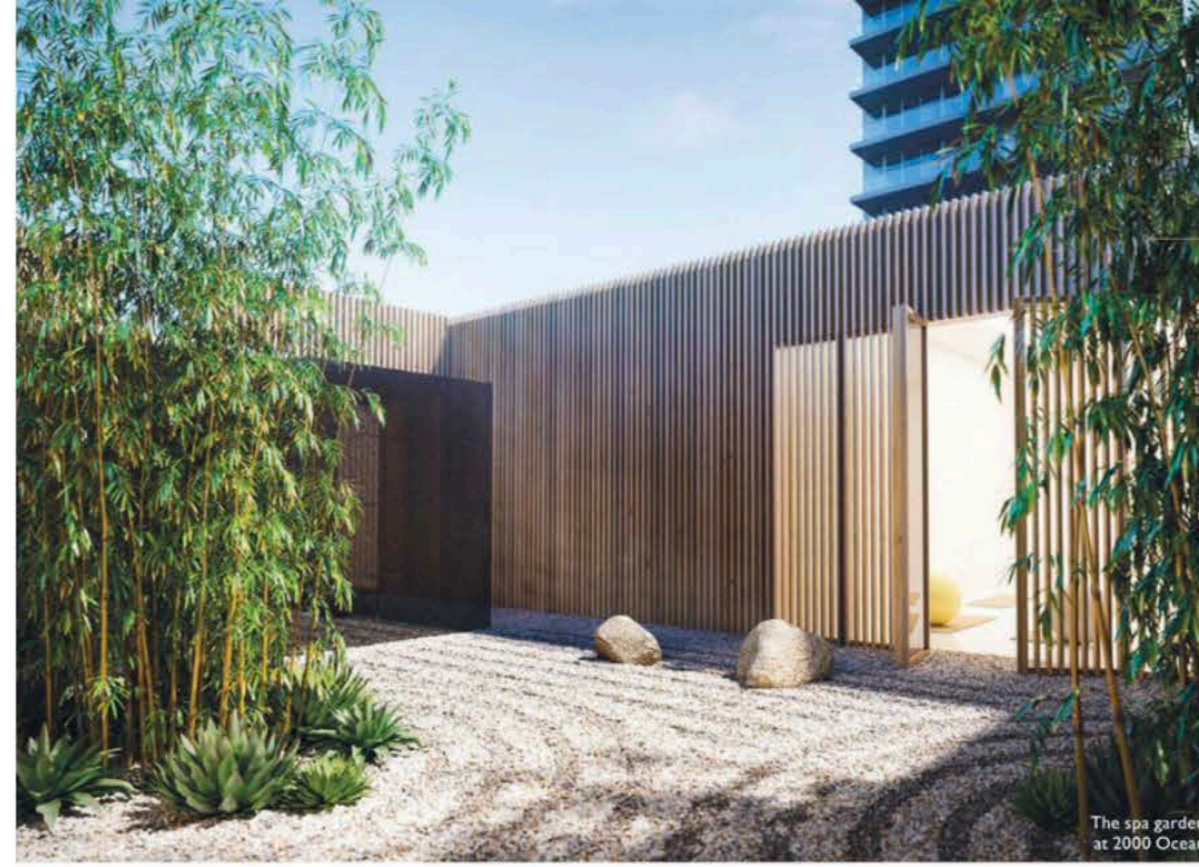
The spa garden at 2000 Ocean