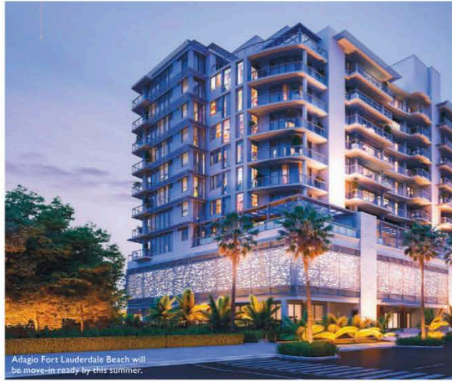
Adagio Fort Lauderdale Beach will be move-in ready by this summer.